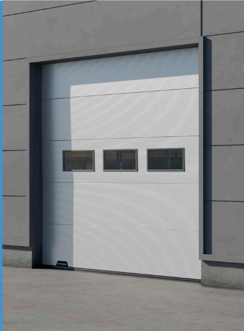
Normstahl overhead sectional door ID40P

This is an overhead sectional door that gives you everything you need – and nothing you don't.