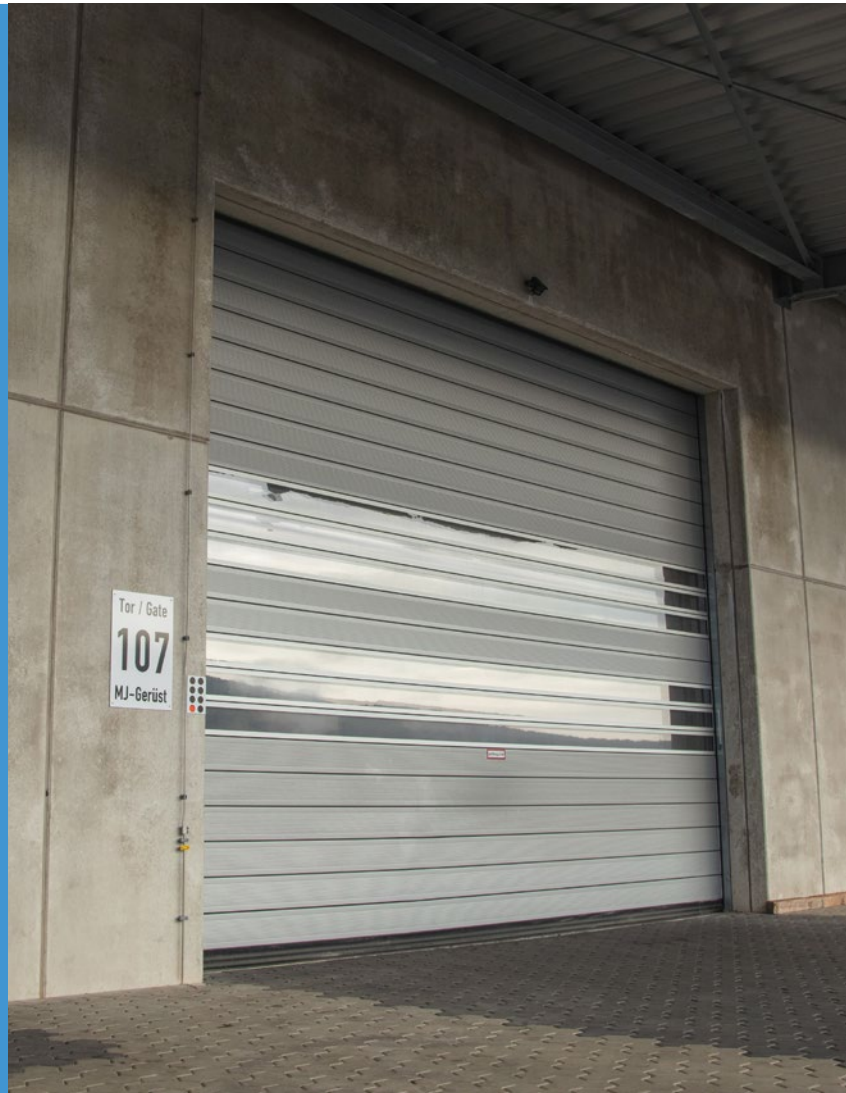
Normstahl high-speed door HSR300AISO

For increased security requirements, the HSR300AISO can be supplied with an additional mechanical locking mechanism. The door curtain of the HSR300AISO is locked with a solid bolt and locked using an ASSA ABLOY security locking cylinder.