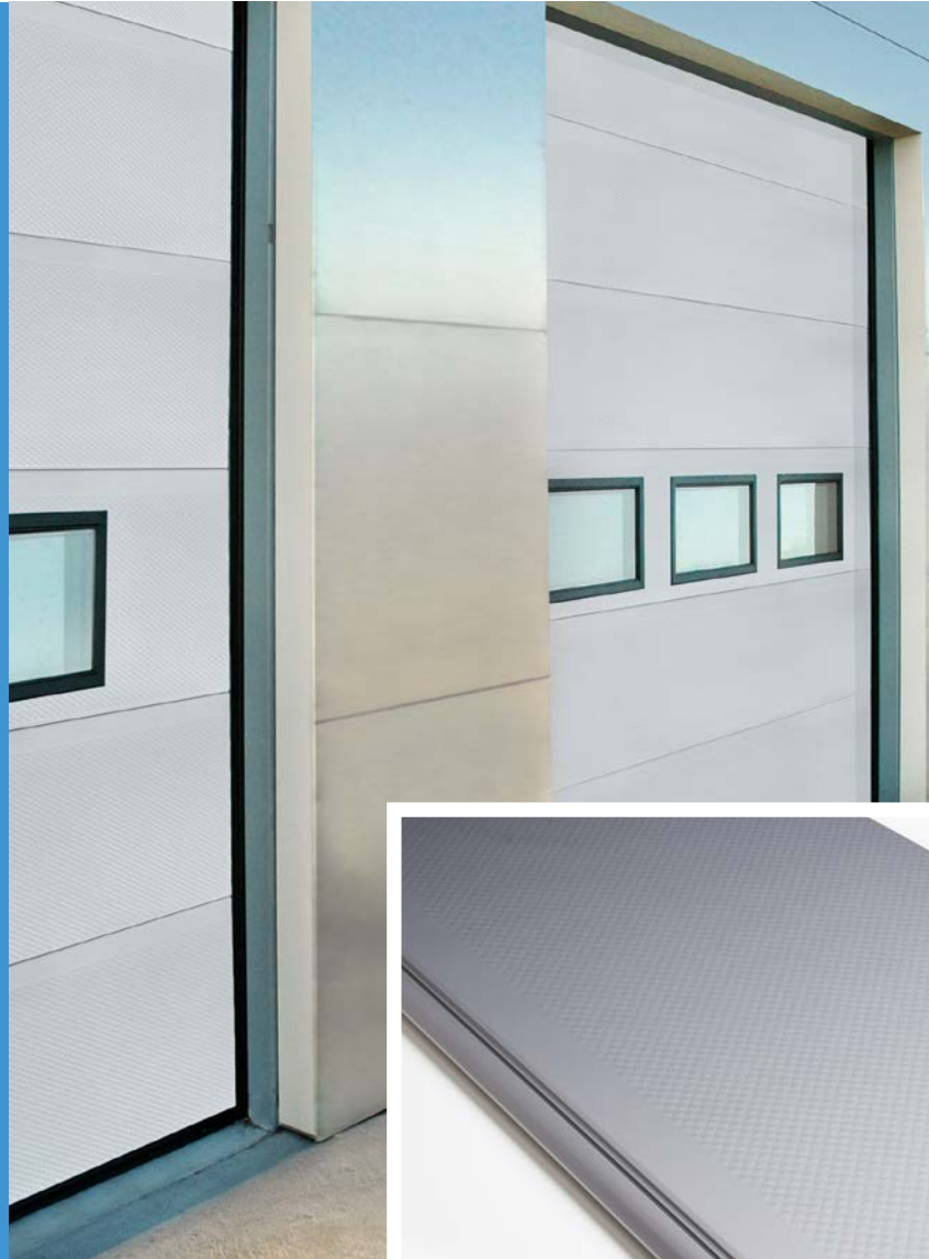
Normstahl Overhead sectional door OSP42A

Choosing from 13 standard outdoor colours, or your own factory painted colour for both the inside and outside. Available with different sizes, panels, window configurations, locks, handles and pass doors, the NORMSTAHL OSP42A overhead sectional door is perfectly suited to every kind of industrial need.