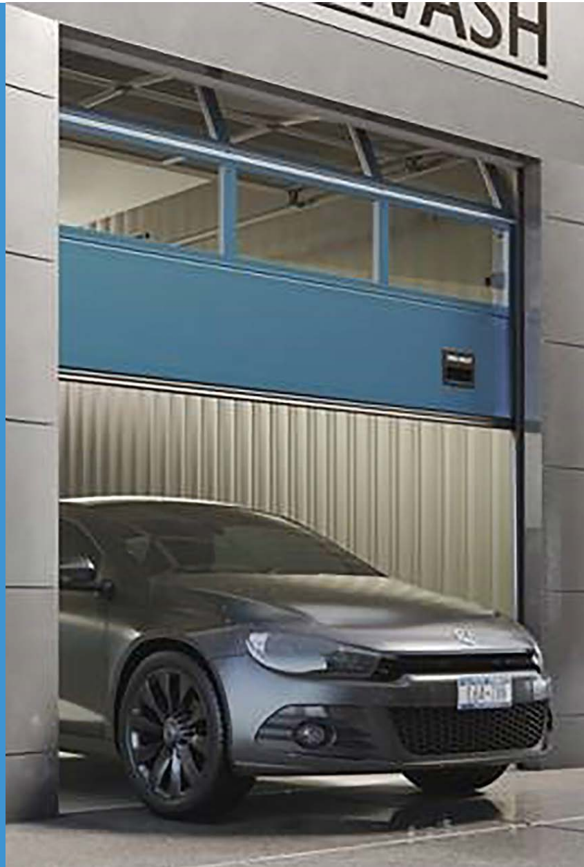
Normstahl Engineered to let your business be busy OSP42DD

The Normstahl OSP42DD operates in the same way as other more standard doors. However, a normal spring-based system has been replaced by a stronger, more optimal motor and control system. This increases the reliability of opening and closing, while reducing the risk of wear and tear, maintenance and complete breakdowns. So your business never has to stop.